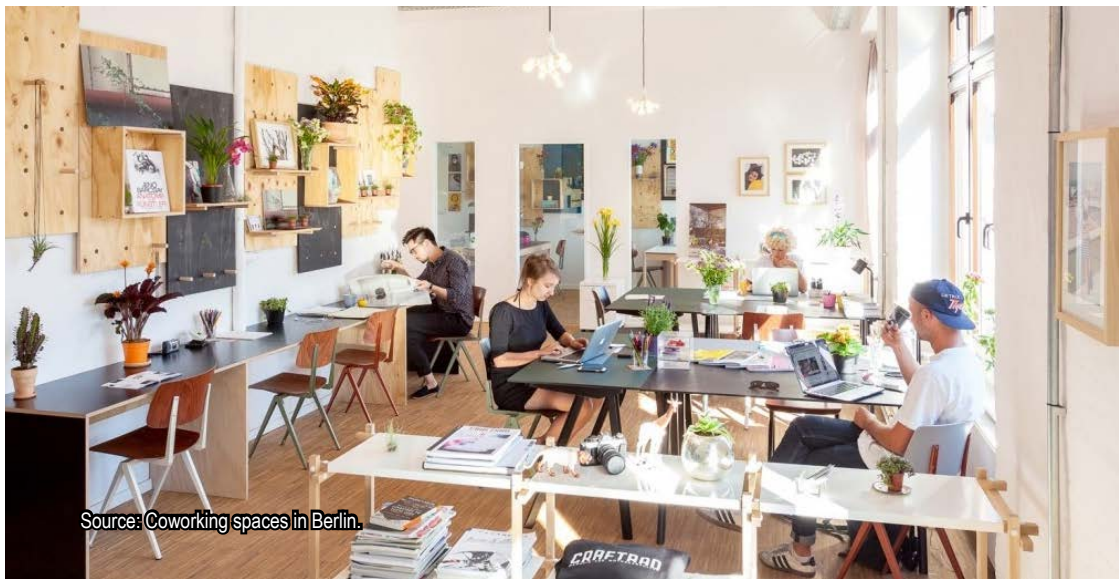
Source: Coworking spaces in Berlin.

This economic/ecological management of housing and land use must also take account in new plans for districts and housing of increasingly popular positive behaviours such as the use of shared cars or bicycles.